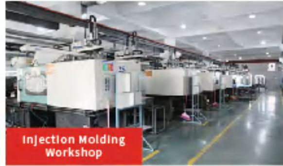
Injection Molding Workshop