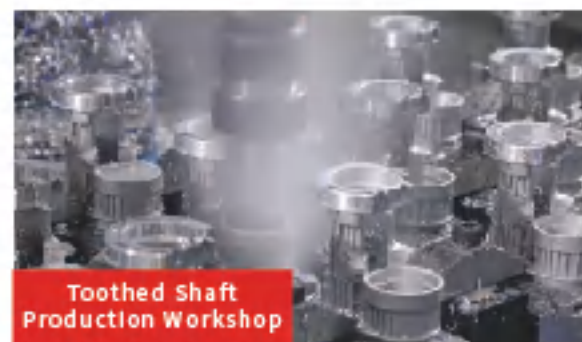
Toothed Shaft Production Workshop