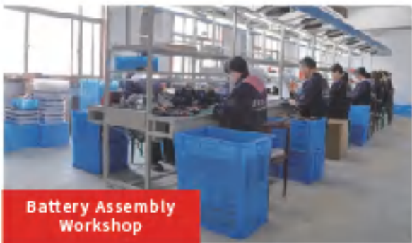
Battery Assembly Workshop