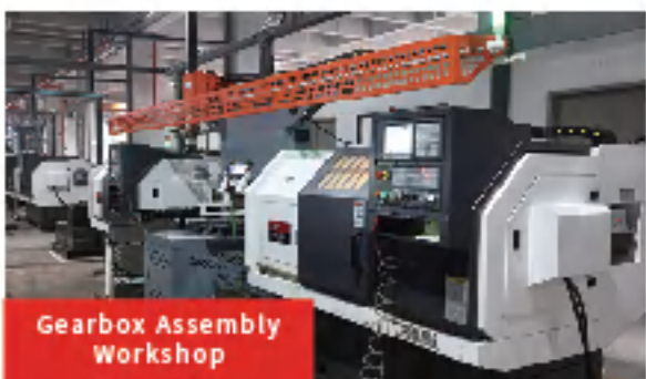
Gearbox Assembly Workshop