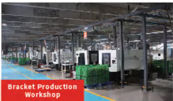
Bracket Production Workshop