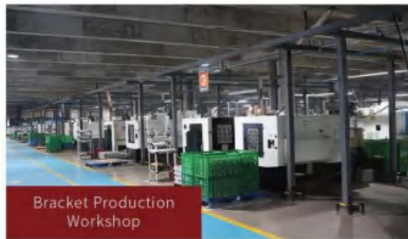
Bracket Production Workshop