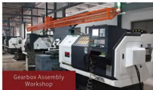
Gearbox Assembly Workshop