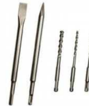
Drill & Chisel Set