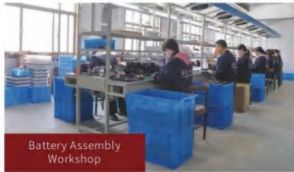
Battery Assembly Workshop