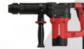
Heavy Duty Hammer