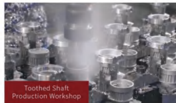
Toothed Shaft Production Workshop