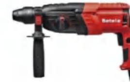
Corded Rotary Hammer