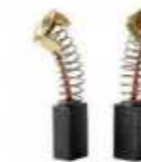
Carbon Brush Set