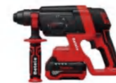
Cordless Rotary Hammer