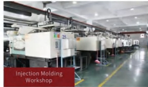
Injection Molding Workshop